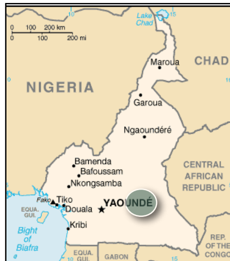
The Makaa people are located east of Yaounde, Cameroon's capital city.